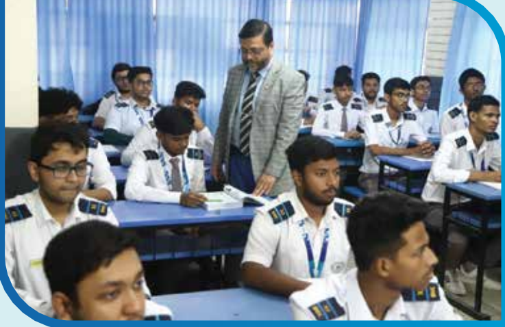
Principal Visited the Classroom